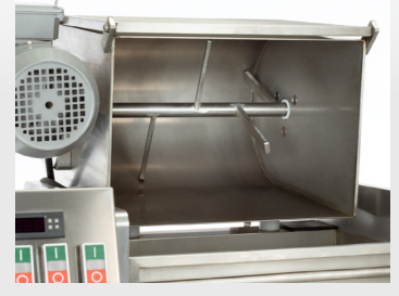
Rear mixer for continuous production