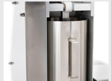
Removable filling canister

The G2 gnocchi maker brings commercial gnocchi production to a restaurant and small batch producer scale in a compact tabletop design. The G2 has a production range of 22-35 lbs/hr (10-16 kg/hr) and produces gnocchi that measures 14mm in diameter and approximately 20mm in length. The G2 is a piston style machine meaning the gnocchi is pressed through before forming. Piston style machines are designed to use a dehydrated potato flake mixture. Potatoes can be used if processed to a texture acceptable for the piston style press. The G2 is constructed of heavy duty stainless steel, designed for any kitchen environment.